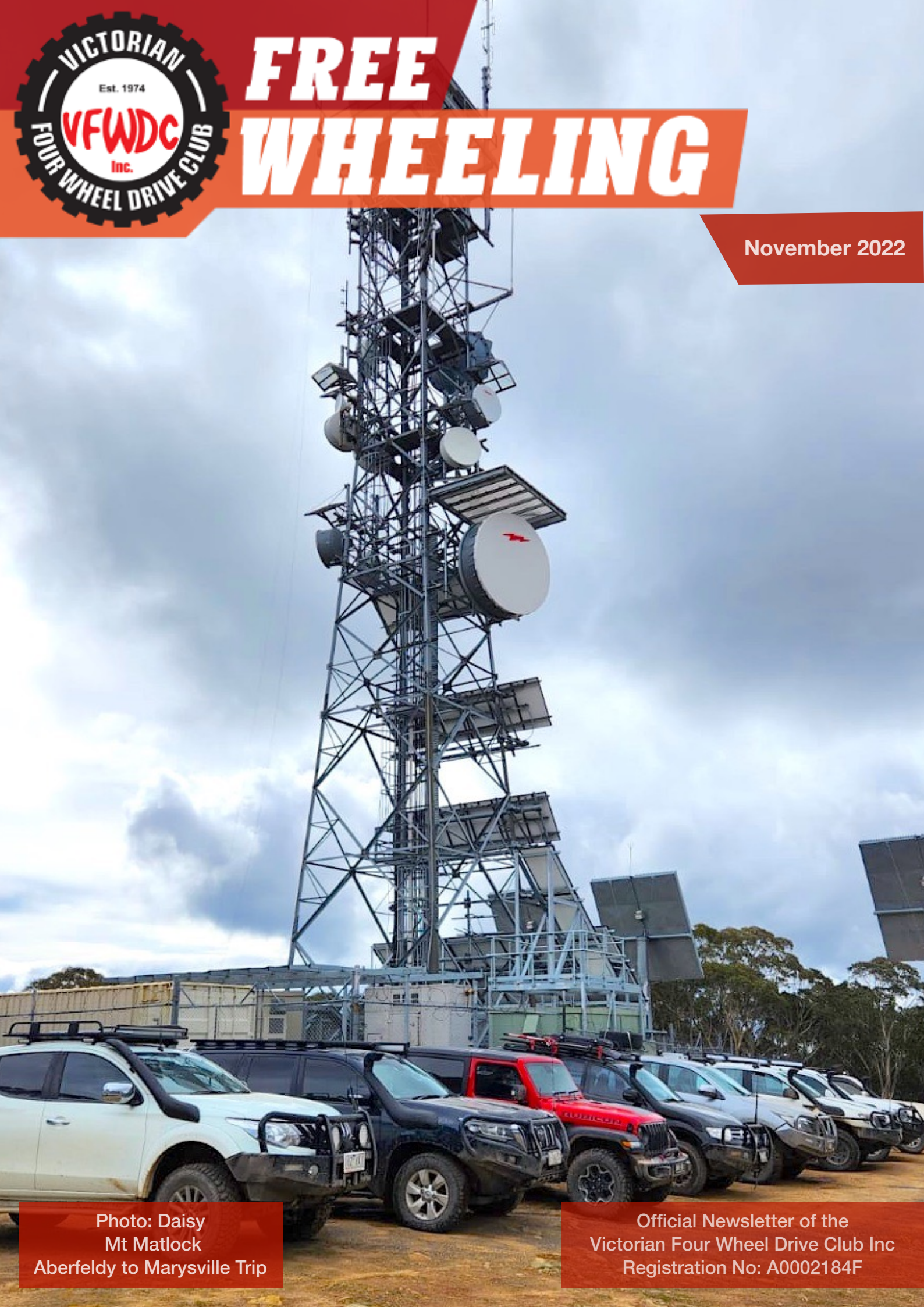
Photo: Daisy Mt Matlock Aberfeldy to Marysville Trip

Official Newsletter of the Victorian Four Wheel Drive Club Inc Registration No: A0002184F