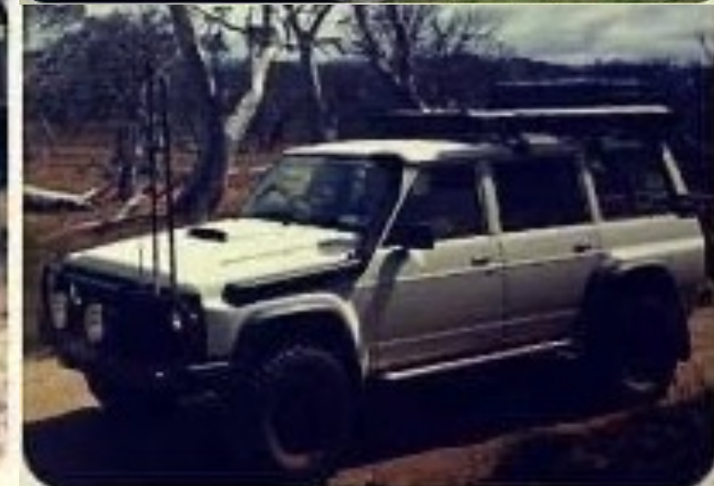
A collage of some of his many previous vehicles