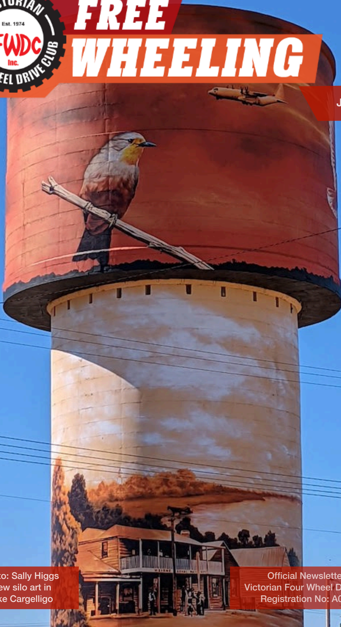
New silo art in Lake Cargelligo

Official Newsletter of the Victorian Four Wheel Drive Club Inc Registration No: A0002184F