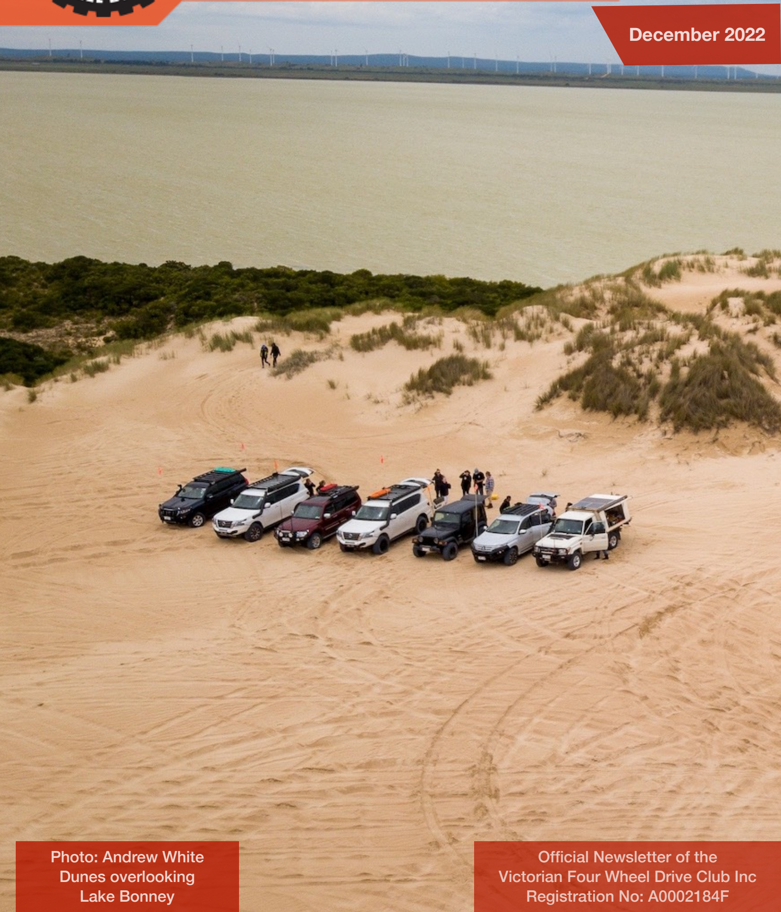
Dunes overlooking Lake Bonney

Official Newsletter of the Victorian Four Wheel Drive Club Inc Registration No: A0002184F