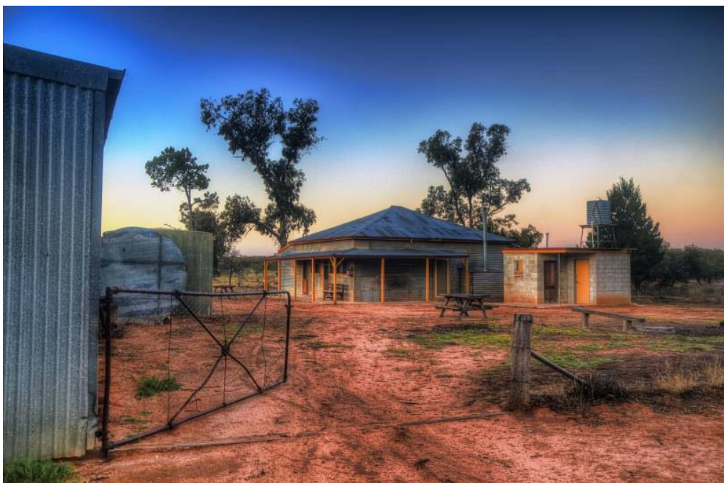
Sunrise at the Shearer's Quarter's