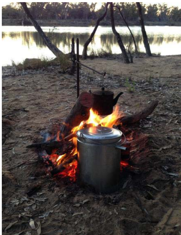
Camp fire at Ned's Corner

Once they got back to camp they then discovered that Stu's chair was still usable and it was only burnt in the top right corner of the chair but Stu still got his new one out to try it and discovered that it was faulty. The wind was still howling and everyone had dinner and went to bed reasonably early that night.