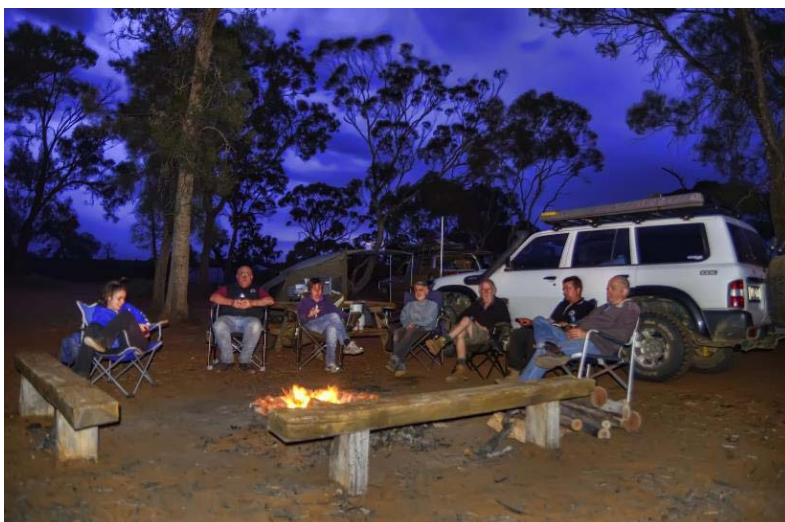
Campfire At Shearer's Quarter's