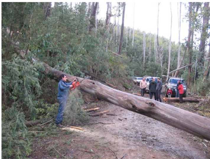
Once the tree was cut and moved aside, we headed back to camp, stopping at Benisons Lookout for some pics.