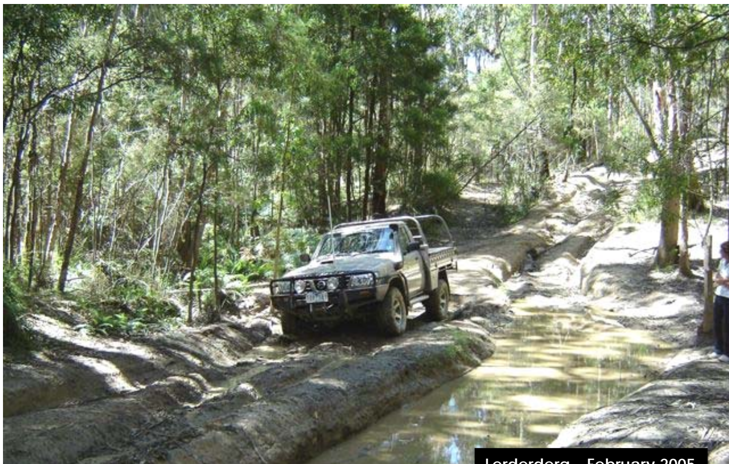
Lerderberg – February 2005