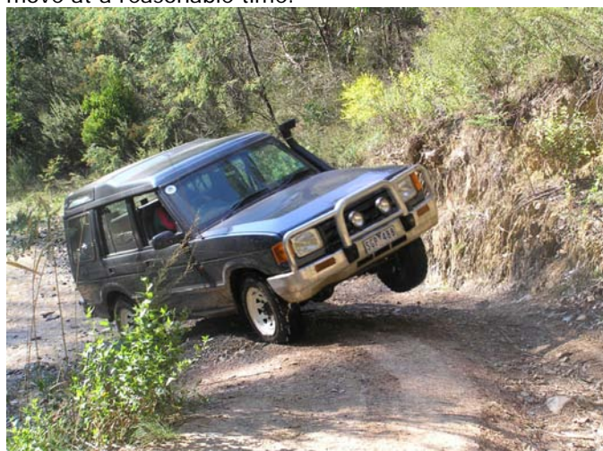
Ian tries the two step!

We woke Sunday morning to find a fox had raided some of the vehicles, missing items were bread, rolls and it also took a liking to Carl's (Terri's) Tupperware containers. Everyone was up early and we were on the move at a reasonable time.