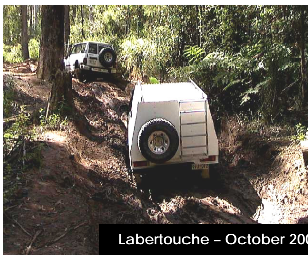
Labertouche – October 2004