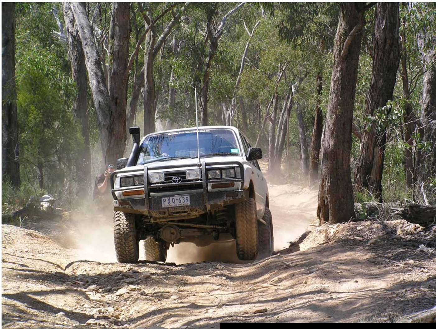
Advanced Training – September 2004